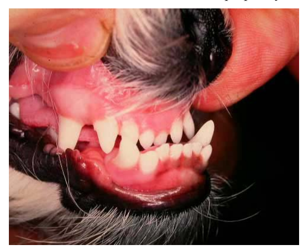
I know, this is not a Boxer but it is a Class III malocclusion and the photo clearly show how the maxillary central and intermediate incisors are going to cut into the floor of the mouth – "Ouch".

By design, Boxers (and Bull dogs, Lhasas, Shih Tzus...) have a maxilla that is too short relative to the mandible. This form of skeletal deformity results in a Class III Malocclusion. In very minor cases, the incisors may be in normal scissors alignment and you have to look closely at the canine and premolar relationships to pick up these ones. In Boxers, it is never subtle or minor – they always have their upper incisors behind the lower incisors. This is referred to as anterior cross bite. While it is a breed standard and purposely selected for, it often causes significant disease.